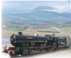
Ravenglass & Eskdale Railway