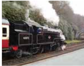
Lakeside & Haverthwaite Railway