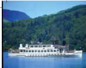
Windermere Lake Cruises