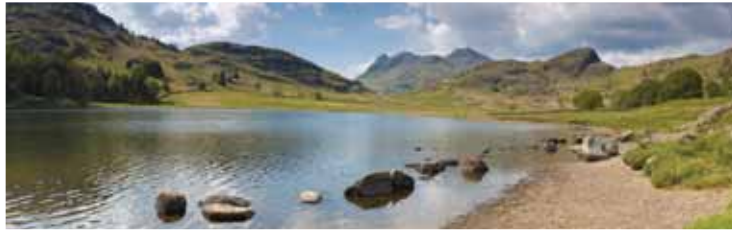
Stunning Lake District scenery