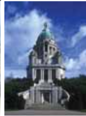
Ashton Memorial, Lancaster