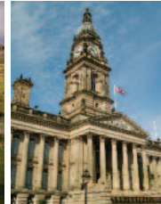
Bolton Town Hall