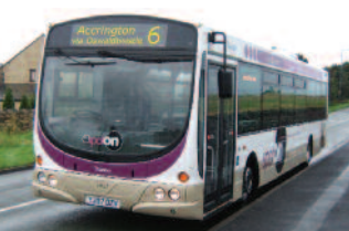
Spot On bus