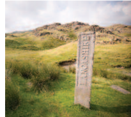
Lancashire old county boundary marker