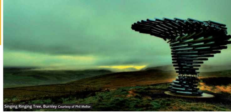
Singing Ringing Tree, Burnley

Mid Pennine Gallery has a changing programme of contemporary work by established, new and local artists, and is located in the basement of Burnley Mechanics, the venue of the Burnley National Blues Festival held every Easter. Historic Towneley Hall has a museum and art gallery with an excellent collection of paintings, ceramics and furniture and, in its brew house, the Museum of Local History will take you back to bygone days. The Queen Street Mill Textile Museum revisits the reign of 'King Cotton' and is located in Briercliffe. Or forget work and visit delightful Thompson Park Boating Lake with its Italian Gardens and miniature railway.