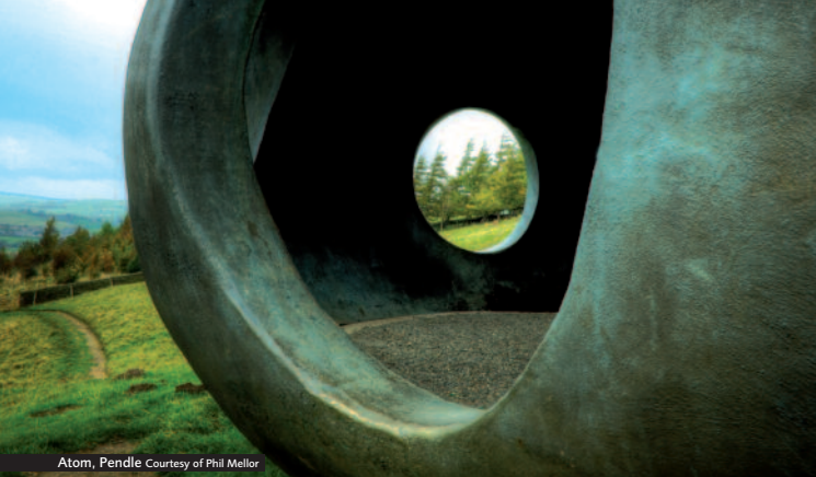
Atom, Pendle