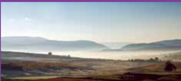
Appleby countryside