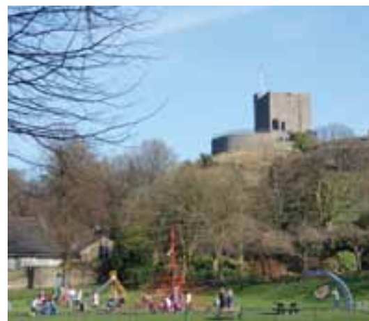
Clitheroe Castle grounds