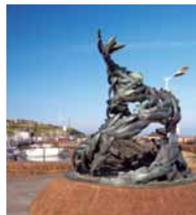
Whitehaven Fish statue © Brian Sherwen