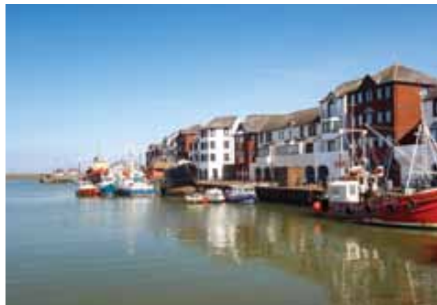
Maryport harbour