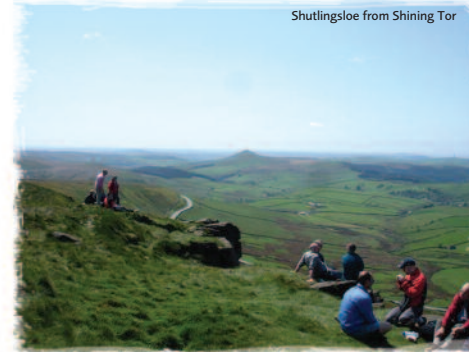
Shutlingsloe from Shining Tor