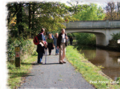
Peak Forest Canal

Buxton is a historic spa town with Georgian architecture. The Opera House is an historic building which is beautifully preserved. Other notable buildings are the Devonshire Dome and the Crescent. The refurbishment of the Crescent is expected to begin in 2011. The Buxton Festival and Festival Fringe take place each year in July, and is one of the biggest arts festivals in the UK. During August, the annual Gilbert and Sullivan Festival takes place. Buxton is an excellent base for walking, and is conveniently served by buses to many parts of the Peak District, including Bakewell, Hartington and the limestone dales.