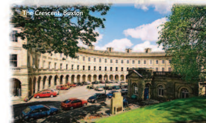
The Crescent, Buxton