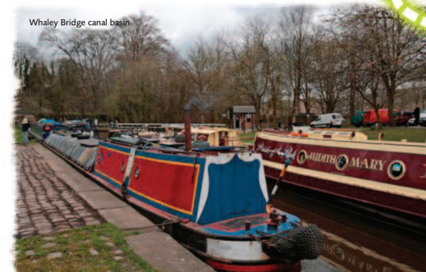
Whaley Bridge canal basin