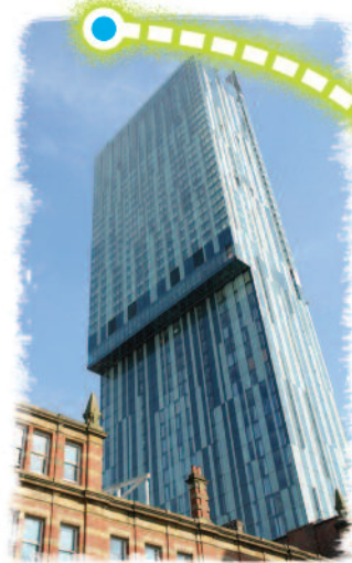
Beetham Tower, Manchester