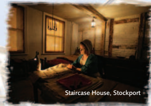
Staircase House, Stockport

Alight at Disley for Lyme Park, with its large historic country house and gardens. The house and gardens (National Trust) are open to the public. Originally a Tudor house, Lyme was transformed by the Venetian architect Leonini into an Italianate palace. Some of the Elizabethan interiors survive and contrast dramatically with later rooms. Lyme Park was featured in the BBC production of Jane Austen's novel Pride and Prejudice .