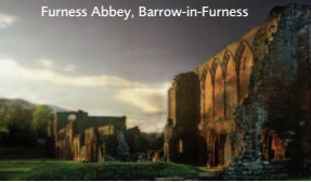
Furness Abbey, Barrow-in-Furness