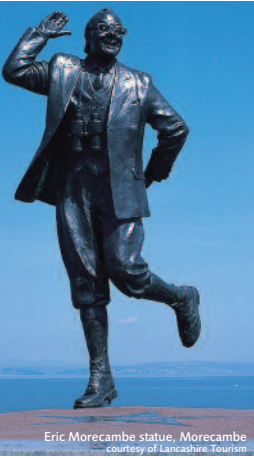
Eric Morecambe statue, Morecambe